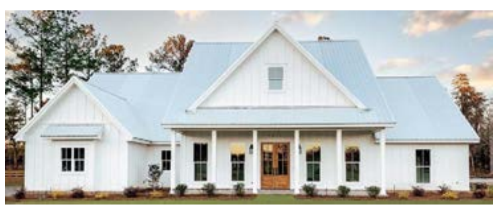
MIDDLE CLASS PRIVATE MARKET BUYERS